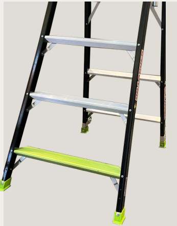
FIRST STEP ALERT