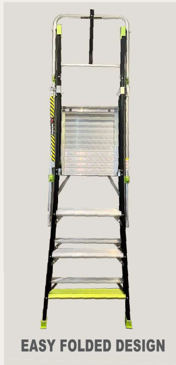
EASY FOLDED DESIGN